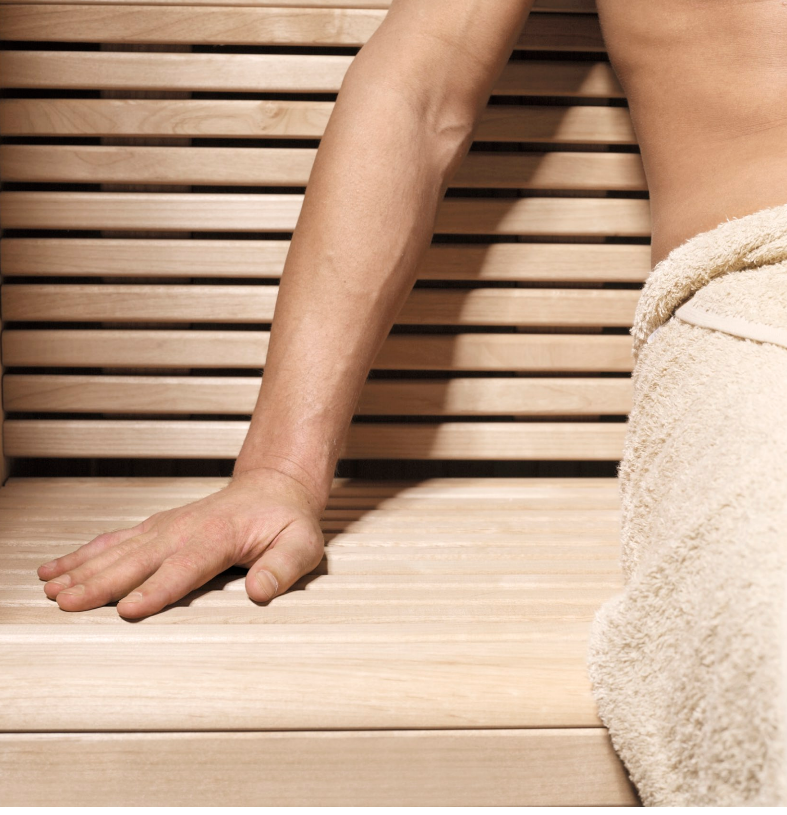
The gently rounded front edge of the bench feels extra comfortable against your legs – and provides further proof of Tylö's attention to detail.